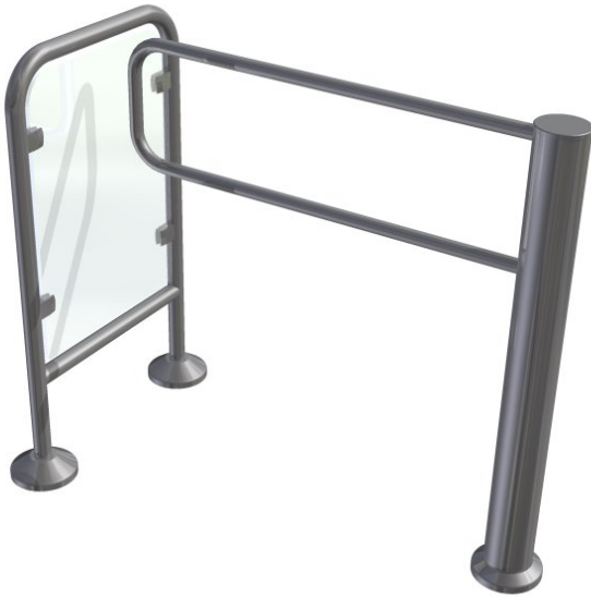
6IKLH1AEC: LEONARDO Holm 1000 with lane guides

Especially suitable to provide access for strollers or wheelchairs at attended indoor entrances to swimming and recreation facilities. In addition to the escape opening via central fire alarm systems, the control panel and emergency exit terminal, the escape route for this product can also be triggered manually in a similar fashion to panic bars.